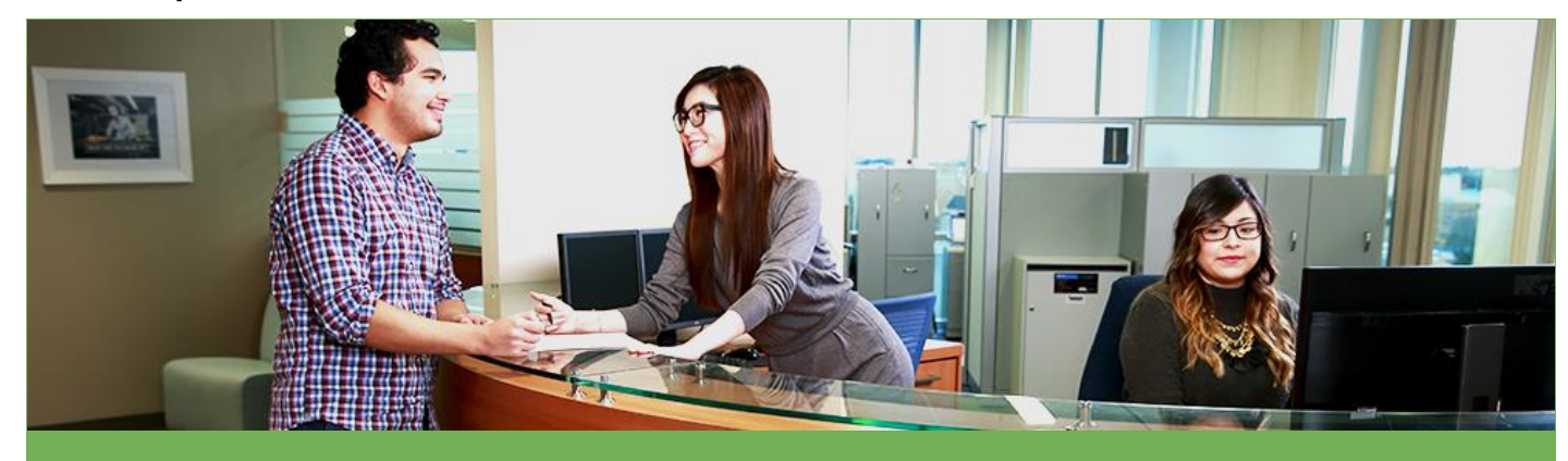
Goal 3: Provide improved services to apprentices and employer sponsors.